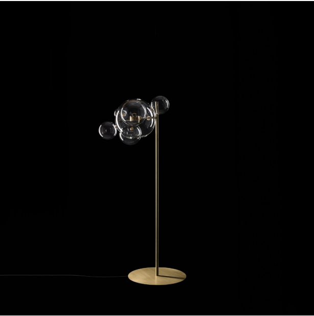
BOLLE FL00R 06

Proprietary Softspot75 LED, 9W, 380 Lumens, 2700K warm white. CRI>95. 50% downwards and 50% upwards