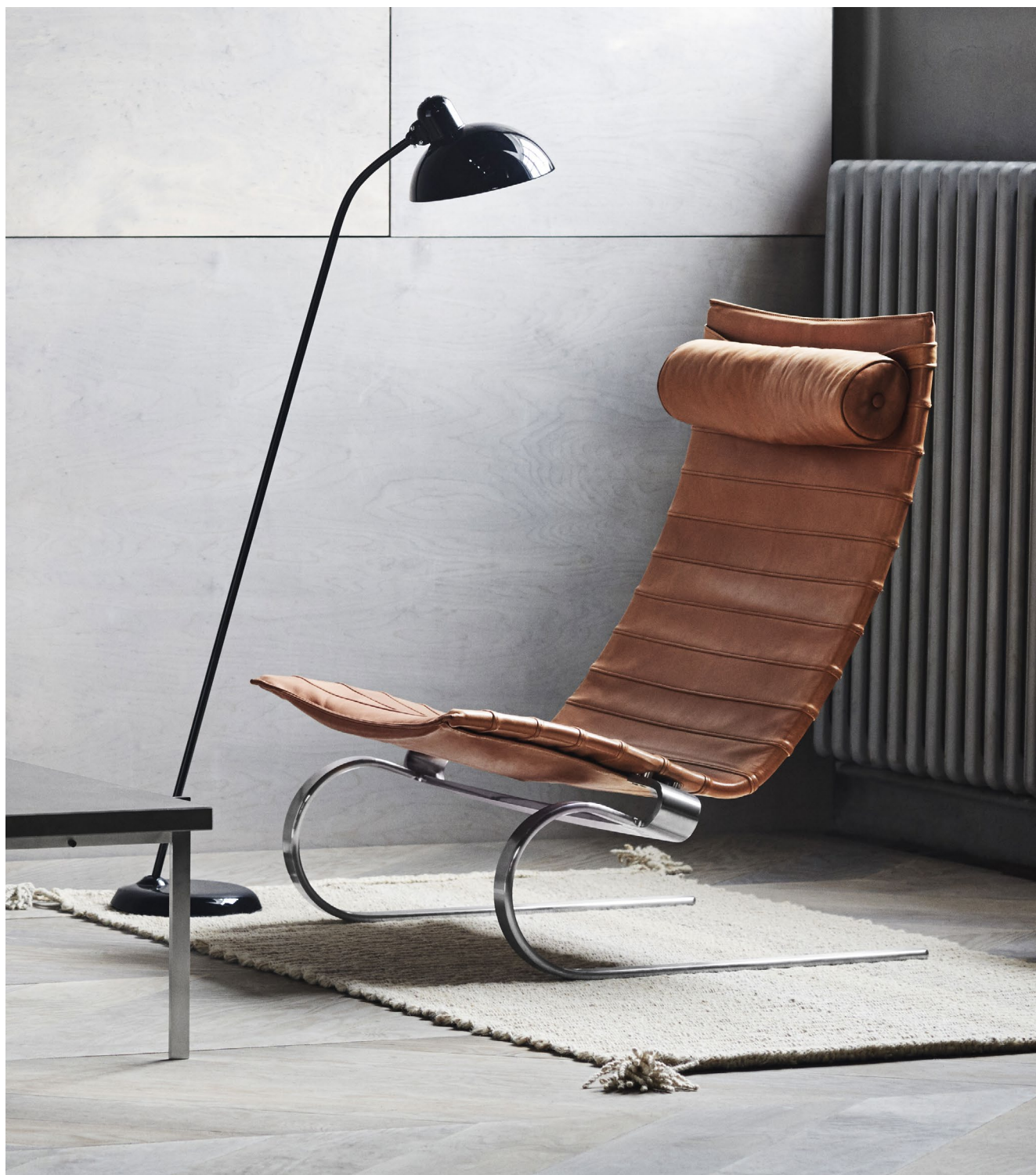
PK20™ PRODUCT FACT SHEET