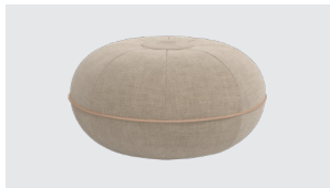
NATURAL TOP: NATURAL LINEN BASE: NATURAL LINEN