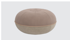
WARM SAND TOP: STEELCUT TRIO 0426 BASE: NATURAL LINEN