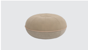
PALE YELLOW TOP: STEELCUT TRIO 0236 BASE: NATURAL LINEN