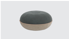
STEEL GREY TOP: SUNNIVA 1079 BASE: NATURAL LINEN