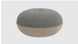
GREY TOP: STEELCUT 0160 BASE: NATURAL LINEN