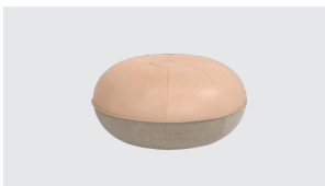
PURE TOP: PURE LEATHER, NATURAL BASE: NATURAL LINEN